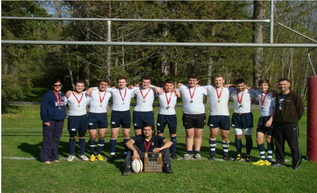
Senior Boys Seven's Rugby—2015 Division Champions