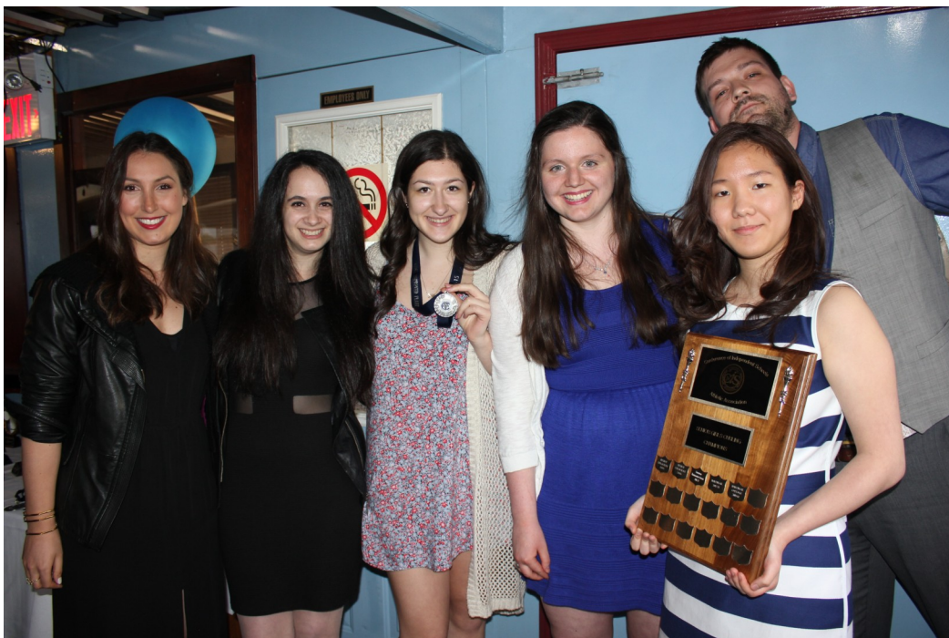
Girls Curling—2015 Division Champions