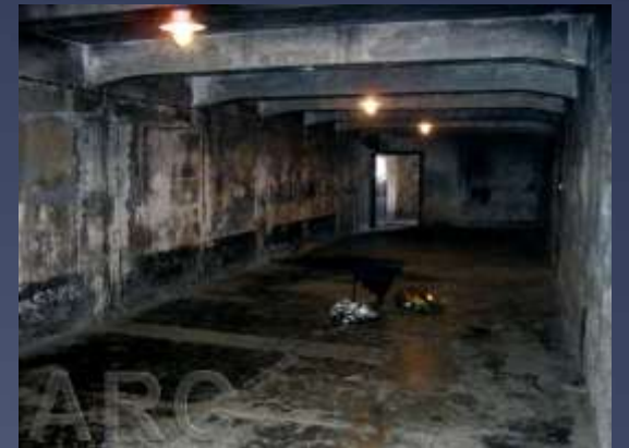
This picture is a gas chamber taken after liberation.