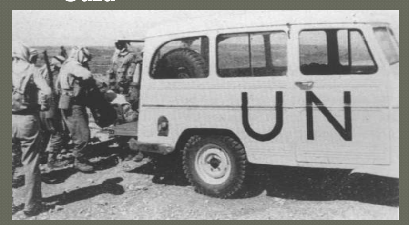
UN truck in Gaza