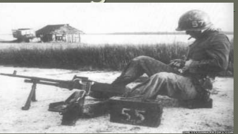
Soldier during Congo Crisis