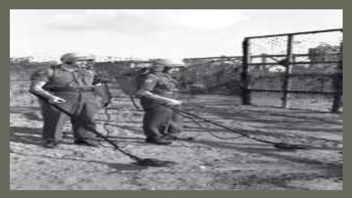
UN engineers near the Suez Canal