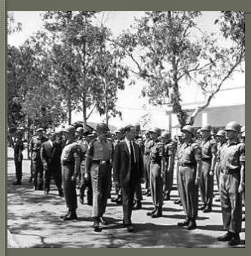
Peacekeepers at attention in Egypt