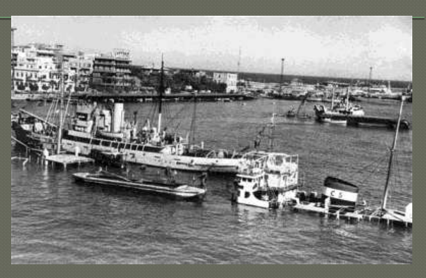
Suez Canal Blockade