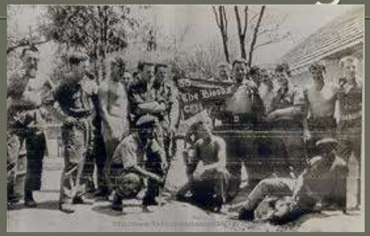
UN peacekeepers in the Congo