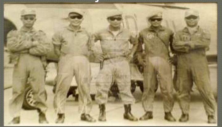
UN soldiers in the Congo